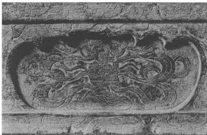
Panel from the Sarcophagus